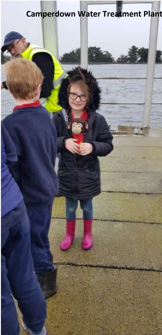
Camperdown Water Treatment Plant